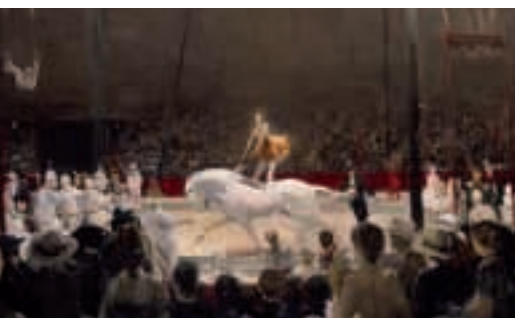
George Bellows – The Circus, 1912

By the 1920s Cubist principles were found in the work of American artists. Critics debated whether Hopper's Manhattan Bridge Loop , 1928, incorporated cubist theory. However, some felt his sense of colour and lateral movement defined the structure – a kind of realist version of the Cubist grid. 3