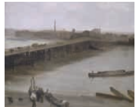
James McNeil Whistler – Brown and Silver: Old Battersea Bridge , 1859-63

departure from the precise detailed paintings of the Hudson River School. With its asymmetrical composition in harmonious greys and browns, the influence of Japanese prints is evident. When comparing Whistler's Battersea Bridge with Winslow Homer's Eight Bells , 1886, we note “a vivid contrast between the energised and aggressive American realism of Homer and the elegant even ethereal European sensibilities of Whistler.” 2