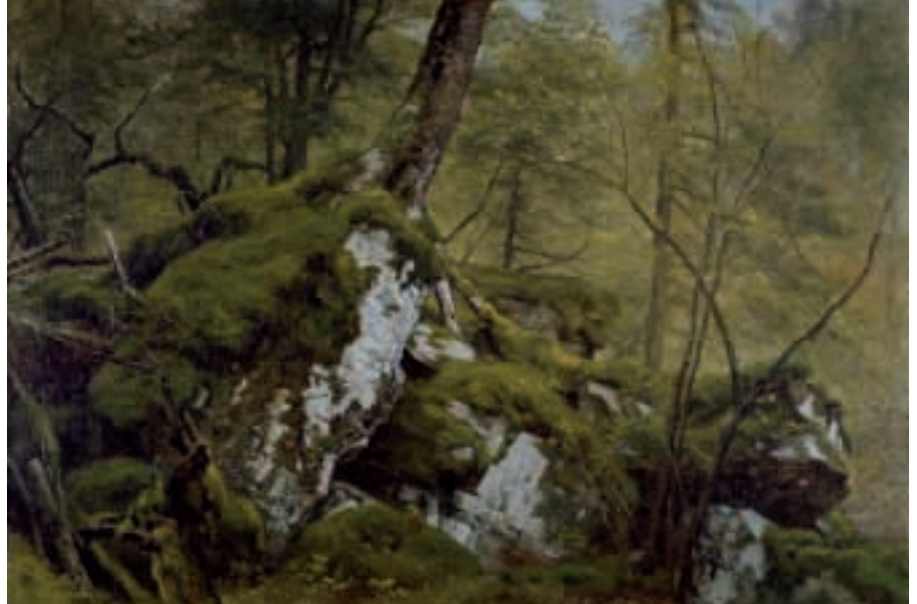
Asher Durand – Study of a Wood Interior , 1855

In searching for an American identity, the 'Coming of Age' exhibition raises key questions: What is American about American art? How can American art find an artistic vision distinct from its European counterparts and establish