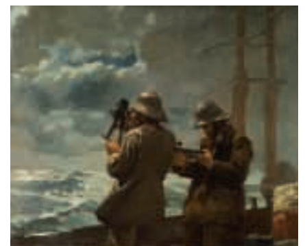
Winslow Homer – Eight Bells , 1886

Once American artists had learned the lessons of the Old Masters and French Impressionists, they travelled along more adventurous avenues. The effects of light and colour, village life and the Barbizon school helped them to shape their own version of Impressionism. A stunning example is Singer Sargent's high-coloured Val d'Aosta: A Man Fishing , 1906, painted in the Italian Alps. This painting is an exuberant web of diagonals, cropped figures of fishermen painted in dashed strokes.