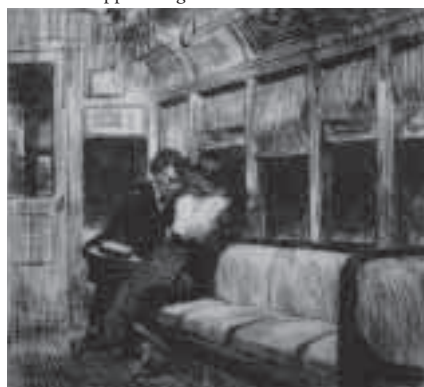
Edward Hopper: 'Night on the El Train'

Various episodes in print-making provide a stunning pictorial history of all levels of society. There is John Sloan's etching Turning