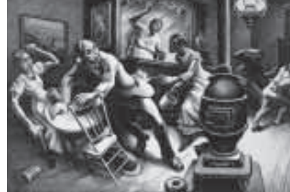
Thomas Hart Benton: 'Frankie and Johnnie'

Out the Light; New York City Life , 1905 which shows a woman kneeling on her bed to turn out the light of a gas lamp. Edward Hopper's etching, Night on the El Train , 1918, pictured here, is a story about a solitary couple who appear to be lost in conversation late at night on the subway. There is an elegant simplicity in Hopper's use of line and shades of grey into black. And Thomas Hart Benton's lithograph Frankie & Johnnie , 1936 portrays a bar scene with Frankie in a white dress holding a bucket and running toward and shooting Johnnie. Chaos and revenge seem to give this image a sense of urgency and movement. Benton has captured the situation with extraordinary clarity.