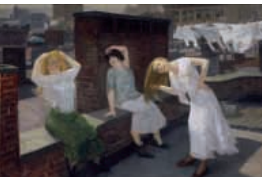
John Sloan – Sunday, Women Drying Their Hair, 1912

Back home American artists recorded urban, regional and patriotic scenes. In 1912 we note some remarkable genre paintings which captured leisured moments. Two good examples seen here are John Sloan's Sunday, Women Drying their Hair and George Bellows's The Circus .