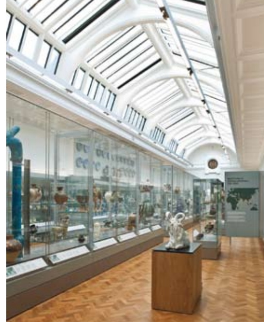
Central Gallery with masterpieces dating from 2500BC

The twentieth century has seen ceramic scholarship gain in prestige by collectors, curators and also in the market place. It is surprising that it was not until the 1920s that scholars recognised Ottoman Iznik ware by Turkish potters as an expression of some of the world's most striking designs. And the artistic and technological techniques in Peruvian and Mexican pottery have come to be regarded as among the finest examples of early civilizations in the Americas. Several examples are displayed in the galleries. Many innovative designs emerged throughout the 20th century. One of the best known is the Art Deco style from the 1920s. It was popularised internationally when work was shown at the Paris International Exhibition of 1925. A superb example of the spirit of the Deco age is seen in the vase by René Buthaud, 1928-30 (pictured). The design is constructed in stoneware with a crackled glaze and incorporates African