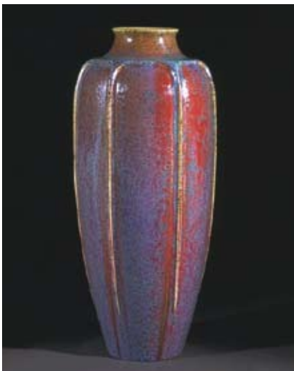
French Stoneware Vase by Delaherche 1892

A magical atmosphere pervades the new ceramics galleries at the Victoria and Albert Museum. After more than five years in the planning and construction, the refurbished galleries opened in September 2009, funded by several private donors. Now the public can enjoy a stroll through a chain of seven galleries which tell stories about centuries of ceramic history, diverse cultures and techniques of production. The collection is organised chronologically in Rooms 140 to