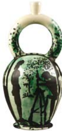
Vase: 'Artist at his Easel' Painted by Picasso, 1954 France

Move on into the larger rooms which benefit from renewed roof glazing so that natural light heightens the beauty of the shapes and glazes in this remarkable collection. Architect Stanton Williams worked with a team of experts and together they have created elegant and spacious quarters for the treasured pottery together with a working studio and a demonstration workshop.