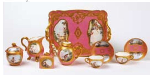
Tea set, 1775 Sevres Porcelain Factory France

There are many stories to tell about china, pots, figurines, studio ceramics, tiles, architectural ornaments and dishes produced for all occasions. One of the many glorious pieces on display is the massive Thirty Gallon Jug (pictured). Made in 1830, it illustrates the technique of transfer-printing on an enormous scale. Described as a tour de force, this is an archetypal product of 19th century Staffordshire British pottery - blue and white transfer printed earthenware. In the 19th century gallery you will find a case which explains the stages involved in transfer-printing methods of production. We can see how designs were engraved onto a copperplate which was then printed onto a medium of transfer such as paper or a thin sheet of gelatin. Next the transfer was placed on the ware itself. Since many transfer-printed wares contain multiple designs, the process was repeated until the sur-