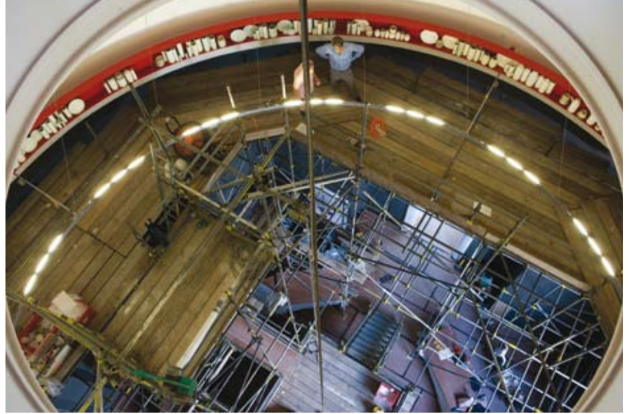
Installing Edmund de Waal's ceramics in the rotunda beneath the dome - Gallery under construction.

145 and features 3,000 of the museum's finest pieces. Take the lift to the 6th floor above the Brompton Road entrance and begin your journey. The stunning domed ceiling sets the scene and houses an original installation, Signs and Wonders, by the contemporary British potter, Edmund de Waal (pictured). As you enter, look up and feast your eyes on de Waal's 450 simple monochrome pots resting on the circumference just below the dome.