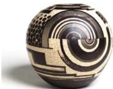
Stoneware Vase with crackled glaze by Rene Buthaud c 1928-30 © V&A images

French pottery and porcelain have always enjoyed a reputation for excellence. We see here (pictured) a Tea Set of Sevres Porcelain, 1773, created for the luxury market. This delicate service is located in the final gallery where there is a temporary exhibit of Objects of Luxury: French porcelain of the eighteenth century. Seemingly fragile, porcelain or 'white gold' was produced for a fashionable clientele and used for banquets and in boudoirs. Its properties allowed colours to fuse deep within its soft, wax-like glaze. In sharp contrast to porcelain,