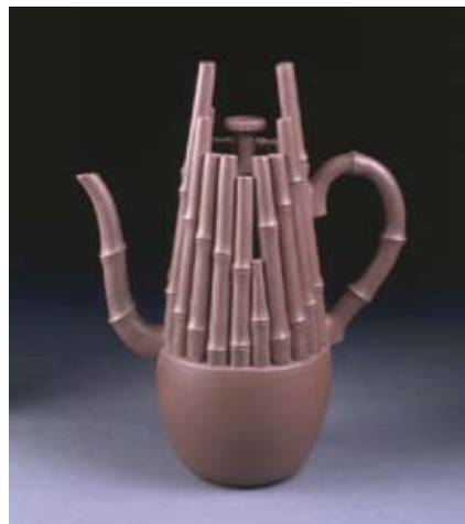
Teapot China Yixing c 1700-1720

French pottery and porcelain have always enjoyed a reputation for excellence. We see here (pictured) a Tea Set of Sevres Porcelain, 1773, created for the luxury market. This delicate service is located in the final gallery where there is a temporary exhibit of Objects of Luxury: French porcelain of the eighteenth century. Seemingly fragile, porcelain or 'white gold' was produced for a fashionable clientele and used for banquets and in boudoirs. Its properties allowed colours to fuse deep within its soft, wax-like glaze. In sharp contrast to porcelain,